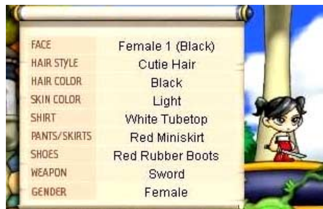
Figure 2. Character creation interface in Maple Story