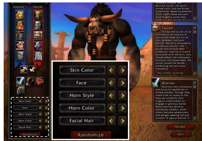
Figure 1. Character creation interface in WoW (available options have been magnified in all figures)

In the second part, we asked our participants to rate a large number of statements about their avatar using a standard 5-point Likert scale. Example statements include "I make avatars that stand out as much as possible" or "I make avatars that reflect a popular trend." These statements (defined in previous research, see [7]) were used to understand the thought process governing avatar customization for each user. Our participants were then asked to compare themselves to their avatar along a number of dimensions, both physical (e.g. height) and psychological (e.g. assertiveness). The latter was accomplished using a methodology identical to the one described in [2]. We then tried to assess our participants' level of attachment to their avatar by having them rate statements such as "I would be