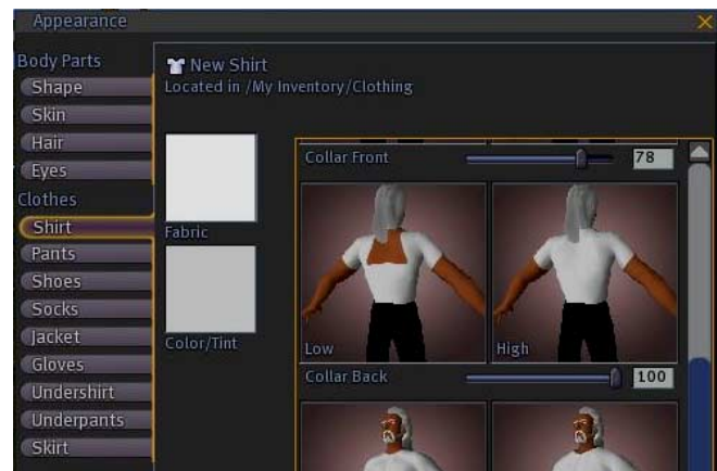
Figure 3. Character creation interface in Second Life

sad if this avatar were deleted by accident" or "I would be willing to sell this avatar to another user."